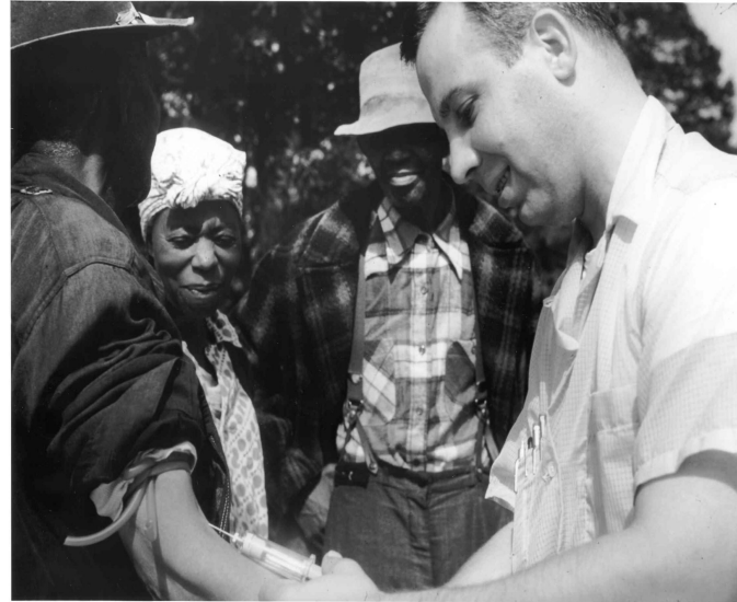
A man receiving treatment in the Tuskegee Syphilis Study