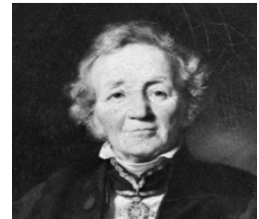
Leopold von Ranke